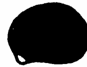
9 very dense