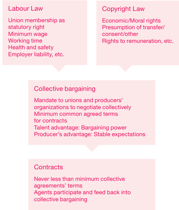
Table 5: Film talent contracts: the legal infrastructure

Moral rights are also an issue for actors worldwide, as legislation varies in the extent to which it grants moral rights to creative contributors other than the authors of the film and the underlying works.