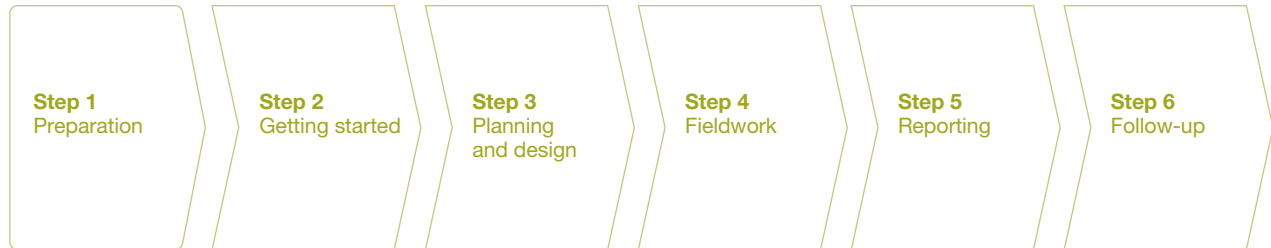
Diagram 4: Steps of a standard evaluation process

Intermediate and final evaluations should fulfill basic principles of independence, impartiality and ethics, in order to be credible and useful. In this sense, the evaluation should be undertaken by someone who has some objective distance from the implementation team – a person seconded from the national audit office reporting their findings to the lead agency or the steering committee, or an outside consultant employed to undertake the review for the lead agency. 2