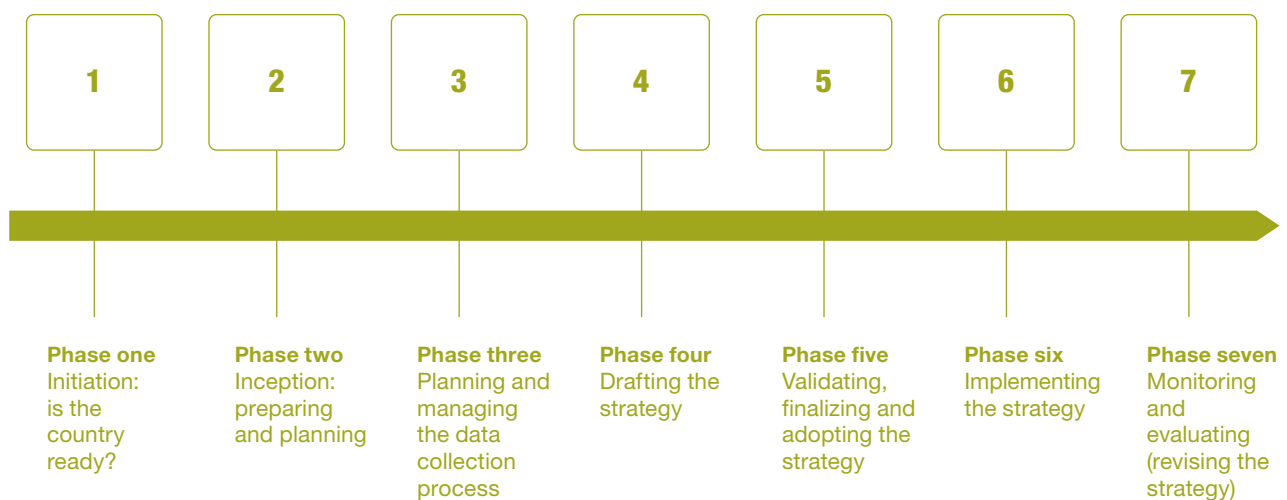
Diagram 1: Phases of the process of developing and implementing a national IP strategy

These seven phases reflect a broad consensus on the main steps in the development and implementation of a national IP strategy based on the experience of many countries to date. However, there is no fixed model and individual national project teams may find it useful to break the phases down into more detailed steps; the discussion of each phase should assist in identifying the detailed steps involved. (Template 1 gives an example of an overall workplan that further illustrates the steps likely to be involved in the planning and development process.) The key is for any national project team to adjust and manage the phases to suit their own national circumstances. In some countries, there may be more prescriptive national planning processes that are different from the phases set out in the Methodology. Again, the discussion of each phase should provide national project teams with guidance on the considerations that they may need to adapt to any national planning approach.