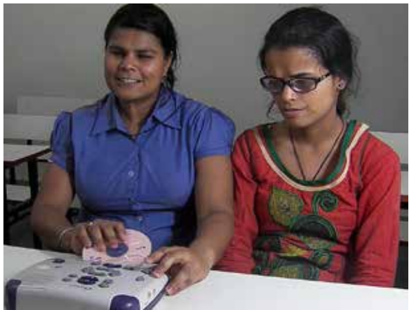
Two women using a DAISY reading device.

Can your company or government make a contribution? Donations of any size are most welcome and can be earmarked to fund specific projects. In-kind contributions are also welcome.