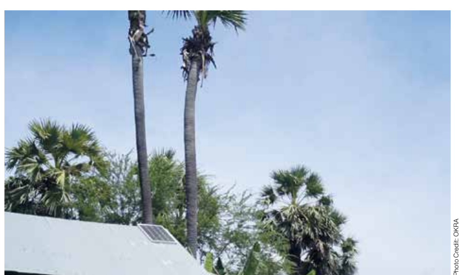
Solar panel installed by Okra, one of the technology seekers identified in Cambodia, at a pilot household in Takeo Province.

In China, Okra & Entrepreneurs du Monde also recently won the grand prize at the 2018 IEEE Empower a Billion Lives regional finals, a global competition that promotes innovative solutions for improved electricity access, organized by the Institute of Electrical and Electronics Engineers (IEEE).