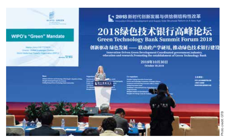
WIPO GREEN gave a keynote speech at the Green Technology Bank Summit Forum 2018

WIPO GREEN will be joining forces with its newest partner – the Green Technology Bank (GTB) in Shanghai – to accelerate green technology transfer in China, in support of the Sustainable Development Goals (SDGs). The GTB compiles eco-friendly technologies and promotes innovation and collaboration in the green technology sector, domestically and globally.