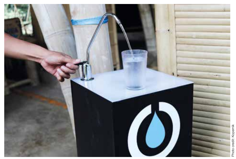
Zero Mass Water dispenser at the Green School in Bali, Indonesia.

The Green School will also use the new hydropanels for educational purposes. By showcasing innovative technologies that use renewable energy to produce water, they aim to inspire the next generation of changemakers.