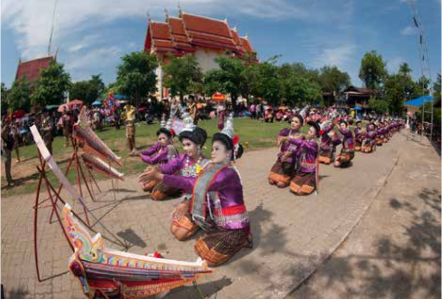
Traditional Thai dancing in Rocket festival "Boon Bang Fai," Yasothon, Thailand, 2013