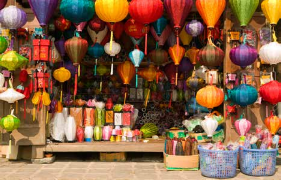
Silk lantern bazaar display, Hoi An, Vietnam