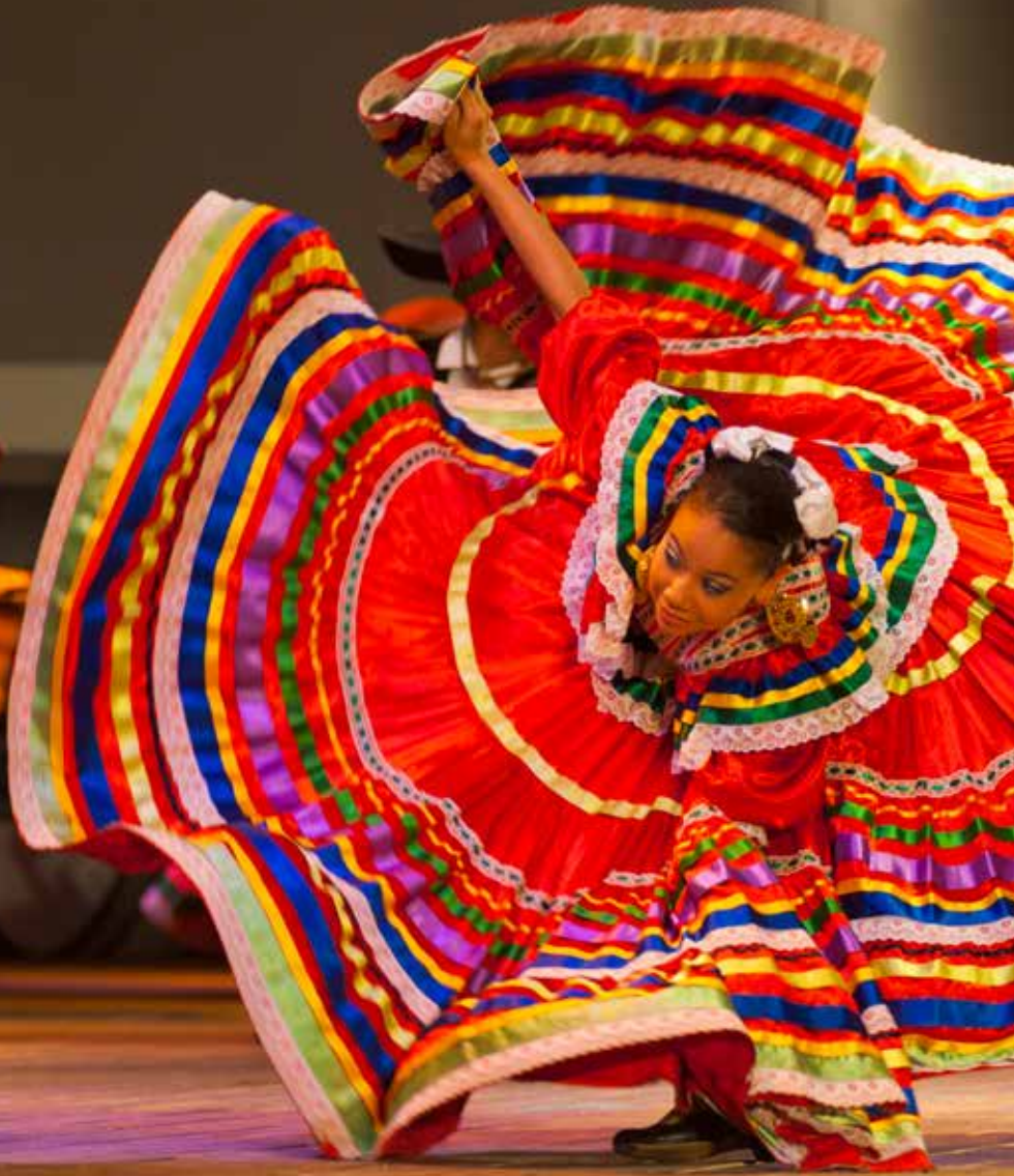
Jalisco Mexican Folkloric Dance, Seoul, Republic of Korea, 2009