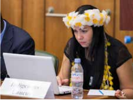
WIPO Intergovernmental Committee on Intellectual Property and Genetic Resources, Traditional Knowledge and Folklore, February 3, 2014

can be used freely at any festival. Works that are based on traditional cultural expressions may be protected by copyright or related rights: for example, a film of a traditional ceremony will likely be protected as a cinematographic work, a recording of a song will attract related rights, a contemporary adaptation of a folksong is probably protected under copyright, and photographs of traditional costumes may not be used without the photographer's permission. In these examples, the use of the work based on the traditional cultural expressions may require prior authorization as is the case for any copyrighted work.