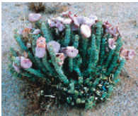
The hoodia plant

parties from misappropriating TK. Other legal tools are more effective against misuse of TCEs. Protection of TCEs/Folklore also touches directly on other policy areas, such as cultural and artistic policy. It is a policy and legal domain that is in practice distinct from, but related to, protection of TK. A separate booklet ( "Intellectual Property and Traditional Cultural Expressions/Folklore" , WIPO Publication No. 913 E) therefore deals with the complementary protection of TCEs, and this booklet focuses on the protection of TK as such – that is to say, the content or substance of knowledge. This reflects the diversity of choices made in many countries: frequently TK and TCEs are protected through distinct legal mechanisms; in some cases, the two aspects are protected under the one comprehensive law.