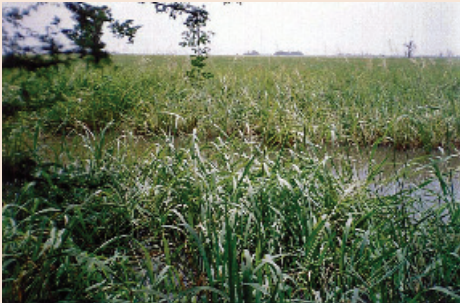
Oryza longistaminata grows in the marshes and river banks of Mali.

concerning conservation, sustainable use and equitable benefit-sharing of genetic resources. In general, the preservation and protection against loss and degradation of TK should work hand-in-hand with the protection of TK against misuse and misappropriation. So when TK is recorded or documented with a view to preserving it for future generations, care needs to be taken to ensure that this act of preservation doesn't inadvertently facilitate the misappropriation or illegitimate use of the knowledge.