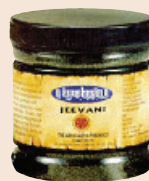
JEEVANI is a product of the Arya Vaidya Pharmacy which is an Indian company.