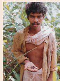
Kani tribal member identifies components of the arogyapaacha plant

In South India the medicinal knowledge of the Kani tribes led to the development of a sports drug named Jeevani, an anti-stress and anti-fatigue agent, based on the herbal medicinal plant arogyapaacha . Indian scientists at the Tropical Botanic Garden and Research Institute (TBGRI) used the tribal know-how to develop the drug. The knowledge was divulged by three tribal members, while the customary rights to the practice and transfer of certain traditional medicinal knowledge within the Kani tribes are held by tribal healers, known as Plathis . The scientists isolated 12 active compounds from arogyapaacha , developed the drug Jeevani, and filed two patent applications on the drug. The technology was then licensed to the Arya Vaidya Pharmacy, Ltd., an Indian pharmaceutical manufacturer pursuing the commercialization of Ayurvedic herbal formulations. A trust fund was established to share the benefits arising from the commercialization of the TK-based drug.