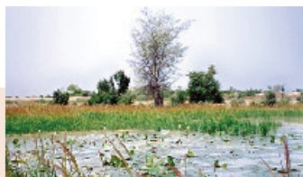
Oryza longistaminata growing near a Bela Community village

Traditional healers of Samoa were recently acknowledged in a benefit-sharing agreement concerning the development of prostratin, an anti-AIDS compound derived from the Samoan native mamala tree ( homalanthus nutans ). Prostratin forces the HIV out of reservoirs in the body, thus allowing anti-retroviral drugs to attack it. The bark of the mamala has been used by traditional healers to treat hepatitis, among other medicinal uses of the tree. This traditional knowledge guided researchers in their search for valuable therapeutic compounds. Reportedly, revenues from the development of prostratin will be shared with the village where the compound was found and with the families of the healers who helped discover it. Revenues will also be applied to further HIV/AIDS research. It is also proposed to license the prostratin research to drug makers so that the resultant drugs are made available to developing countries for free, at cost, or at a nominal profit.