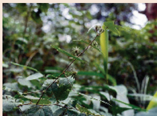
The arogyapaacha plant from which the Jeevani drug was developed and subsequently patented by the Indian research institute TBGRI.