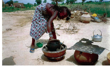
Preparation of Oryza longistaminata for food consumption, Mali

Customary laws, protocols and practices often define how traditional communities develop, hold and transmit TK. For example, certain sacred or secret TK may only be permitted to be disclosed to certain initiated individuals within an Indigenous community. Customary laws and practices may define custodial rights and obligations over TK, including obligations to guard it against misuse or improper disclosure; they may determine how TK is to be used, how benefits should be shared, and how disputes are to be settled, as well as many other aspects of the preservation, use and exercise of knowledge.