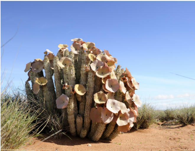
The Hoodia plant

Indigenous healers in the western Amazon use the Ayahuasca vine to prepare various medicines, imbued with sacred properties.