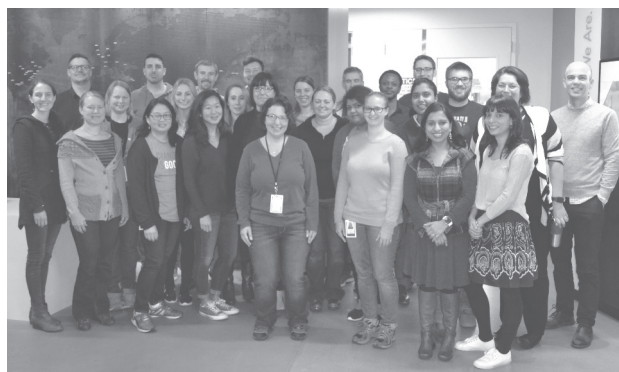
TB group, Infectious Disease Research Institute

She further reflects on the value of collaborative partnerships.